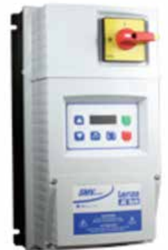
AC Variable Speed Drives Nema 4X, Built-in Disconnect