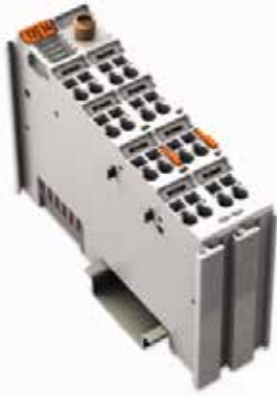
Bluetooth Wireless Communication