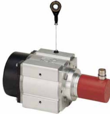
Heavy Duty Cable Retractor