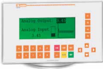
HMI Operator Panel Send Commands, Read Status, Write Variables, and more.