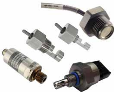
Flow, Pressure, Level, Temperature