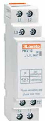
Voltage Monitoring Relays