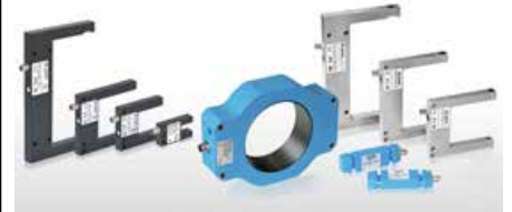
Standard & Special Sensors for Industrial Automation