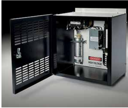
HG7 Series Harmonic Filters