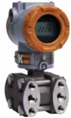
Model PAD Explosion Proof Differential Pressure Transducers